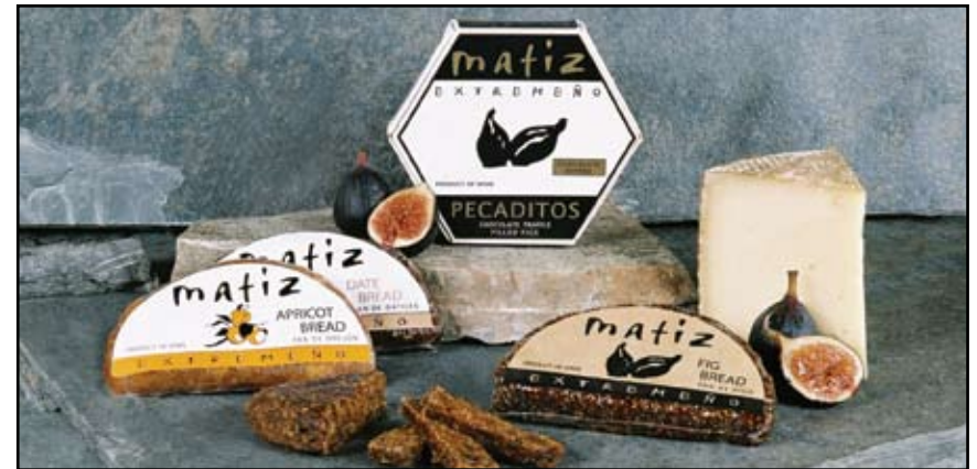
Fig Bread also available in 11 lb (5 kilo) wheel MZE10

Apricot Bread: dried apricots and almonds. MZE02